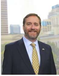
Dave Yost Ohio Auditor

One of the duties of the Ohio Auditor of State's Office is the oversight and operation of Ohio's government fraud hotline. Established by Ohio law in 2012, our office maintains a system for reporting fraud, including misuse and misappropriation of public money, including those by any public office or official. Many Ohio communities often lack the resources and specialized training to track down fraud and the misspending of tax dollars, which is why the hotline was created in the first place.